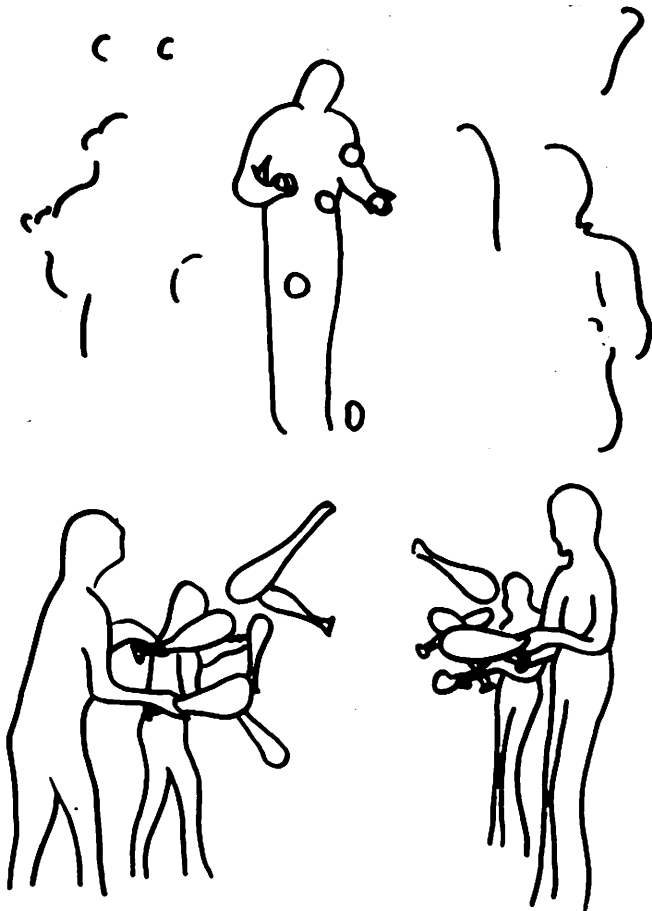
Illustrations from "Piano-Forte"