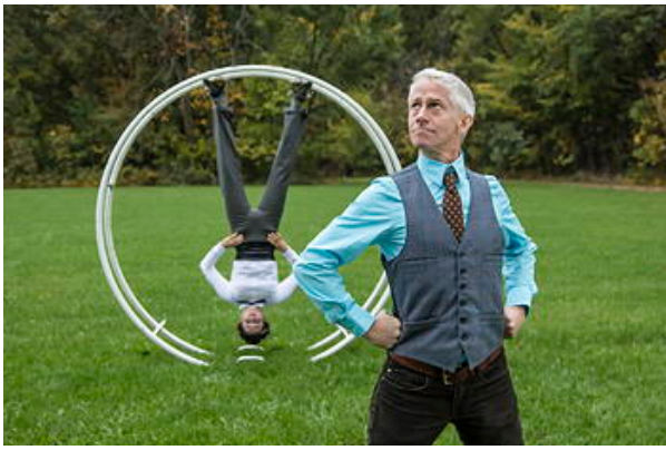
KamiKaze FireFlies Cascade of Stars Emcees