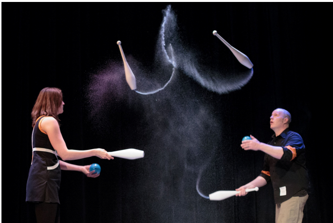
Institute of Juggology Cascade of Stars