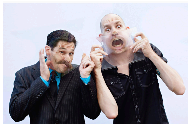
Team Rootberry Welcome Show