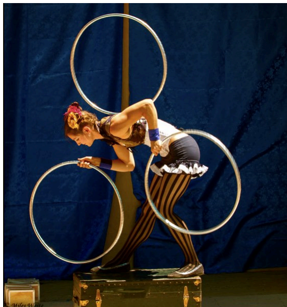
Kelsey Strauch Welcome Show