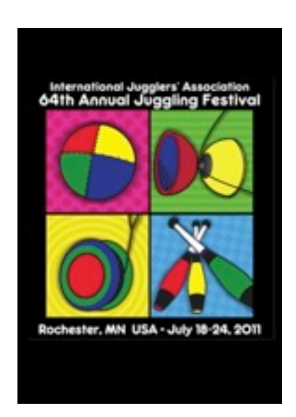
Rochester 2011 2-DVD set Member Price: $30.00 IJA Store